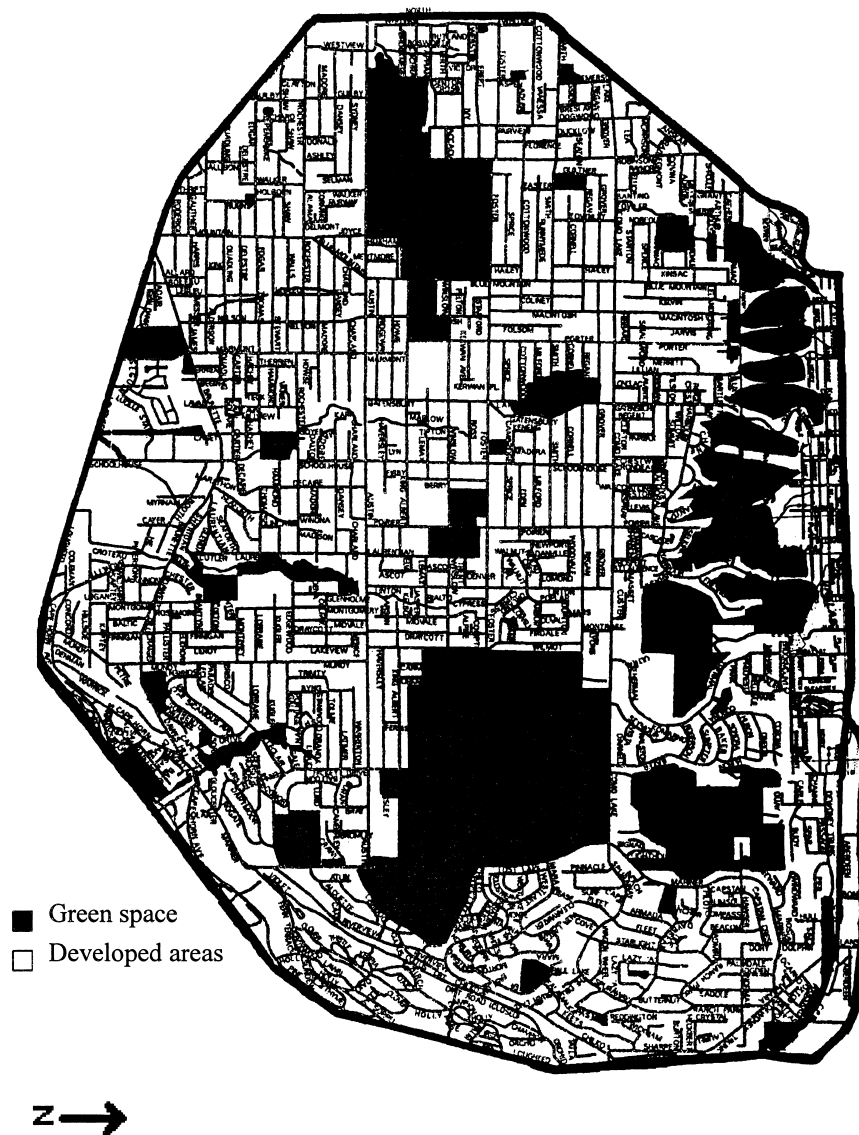
Figure 1. Map of the study area in Coquitlam, British Columbia (Schaefer et al. 1992; City of Coquitlam 1999). The metapopulation zone is an area bounded by Lougheed Highway, North Road, Clark Road, St. John's Street, and Barnet Highway. The total area of the zone is approximately 2,000 ha. The mother node (largest green space) is about 175 ha. Map not to scale.

The study zone is in south Coquitlam and south Port Moody, British Columbia, just east of the city of Vancouver. They are part of the larger urbanized region of